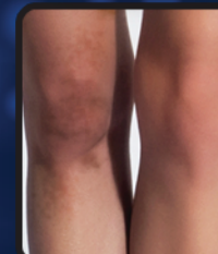
Strange Marks on Neck